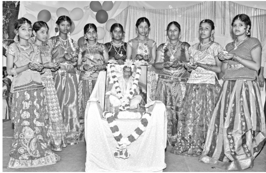
Ashram School Annual day celebrations